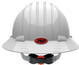
Ratchet for adjustment accessible in the back

BRANDING: Branding with Your Logo is available for a number of P.I.P. products. Call any of our 22 locations for details & information!