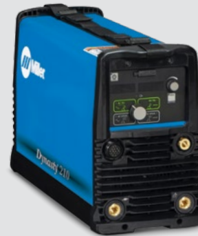
TIG Welder 907685