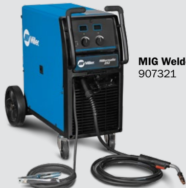
MIG Welder 907321