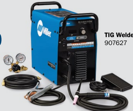
TIG Welder 907627