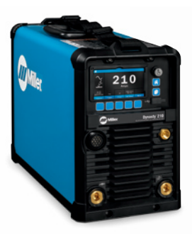
Dynasty 210 Machine only