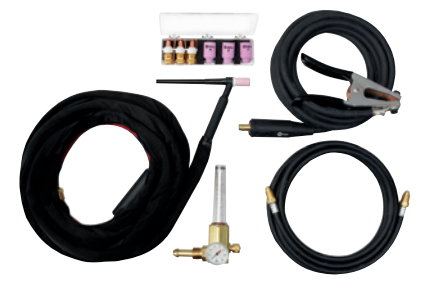
300185 kit shown.