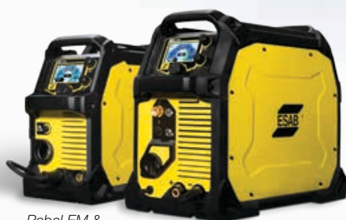
Rebel EM & EMP 215ic