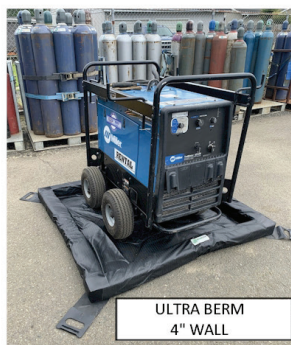
ULTRA BERM 4" WALL