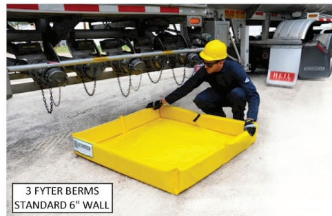
3 FYTER BERMS STANDARD 6" WALL