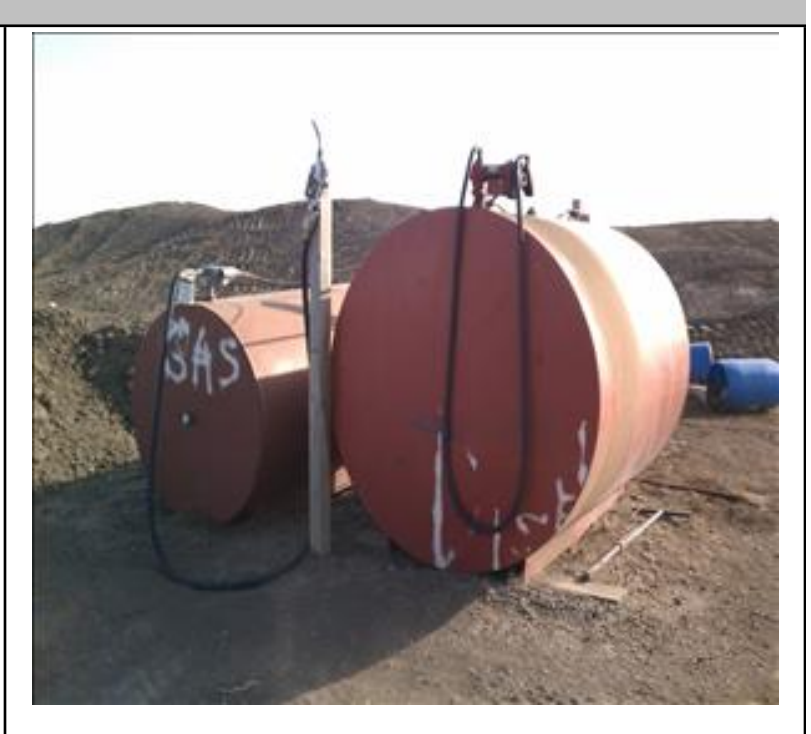
No labels and no berm.

Notes: Improper labeling on fuel tanks. Need to contact company that services the tanks. Responsible Party: Glidden LLC