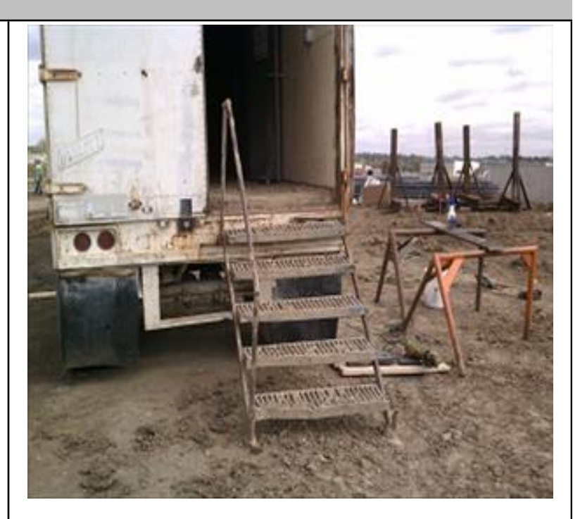
These stairs need to be repaired or replaced!

Notes: Stairs to storage trailer need to be repaired, add hand rail on right side. Responsible Party: Glidden LLC