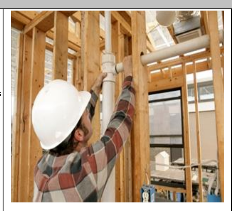
Need to use gloves when handling adhesives